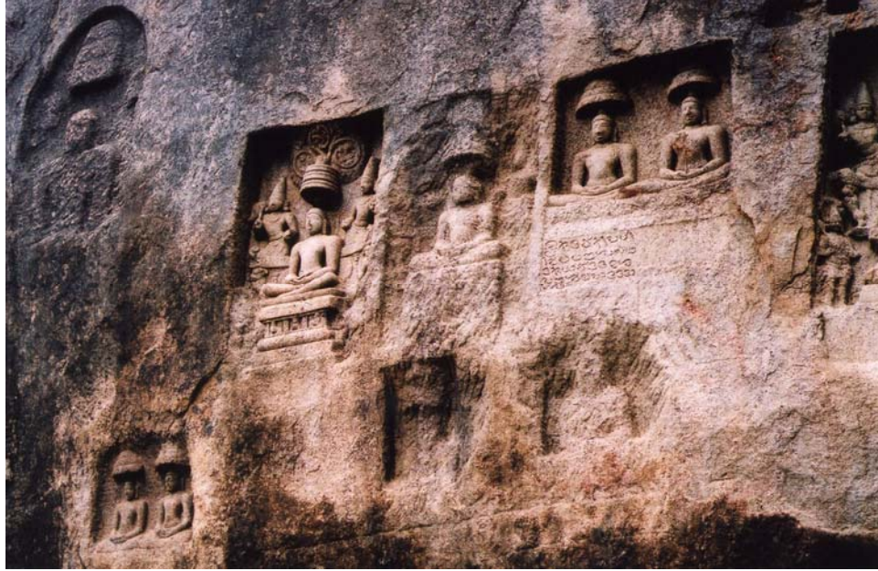
Figure 8: Left side of Group 5 at Kalugumalai

Also in contrast to the other four groups, the reliefs comprising Group 5 include two individual panels of female deities: the goddesses Padmāvātī and Ambikā. Rather than