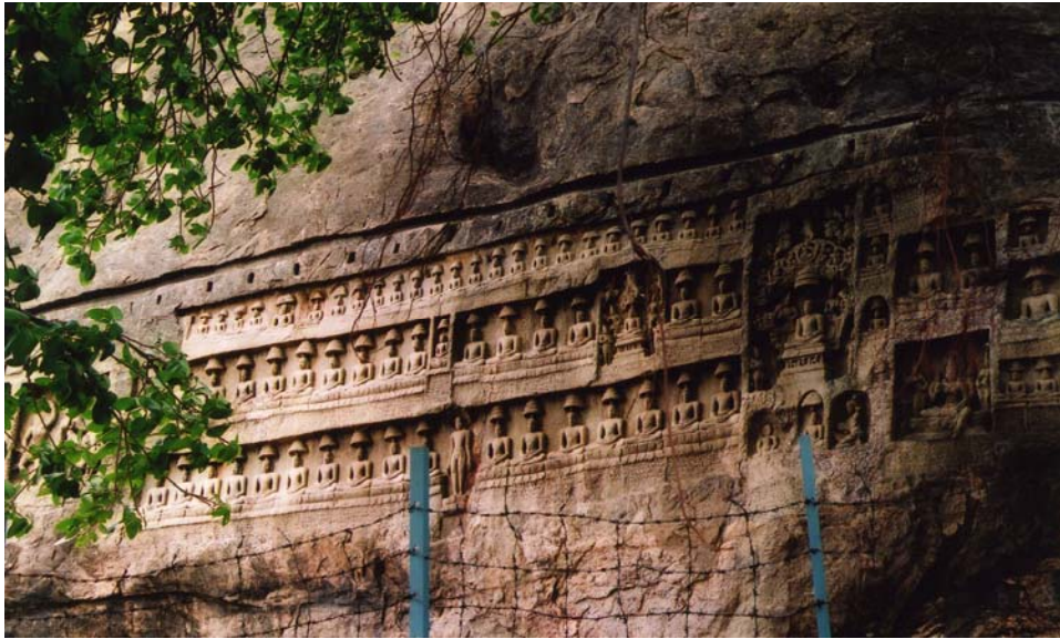
Figure 7: Group 5 at Kalugumalai

branches of a large tree. The images in Group 4 (Figure 6) are carved into a shallow rock-cut shelter in the lower right corner of the rock formation. The shelter may have originally been a natural cavern that was subsequently modified by Kalugumalai's artists. It measures approximately two feet in depth and there are seven seated Tīrthaṅkaras that flank a central Jina triad. Carved on either side of the central triad are standing images of Gommaṭeśvara and Pārśvanātha. All of the images are carved with donative inscriptions.