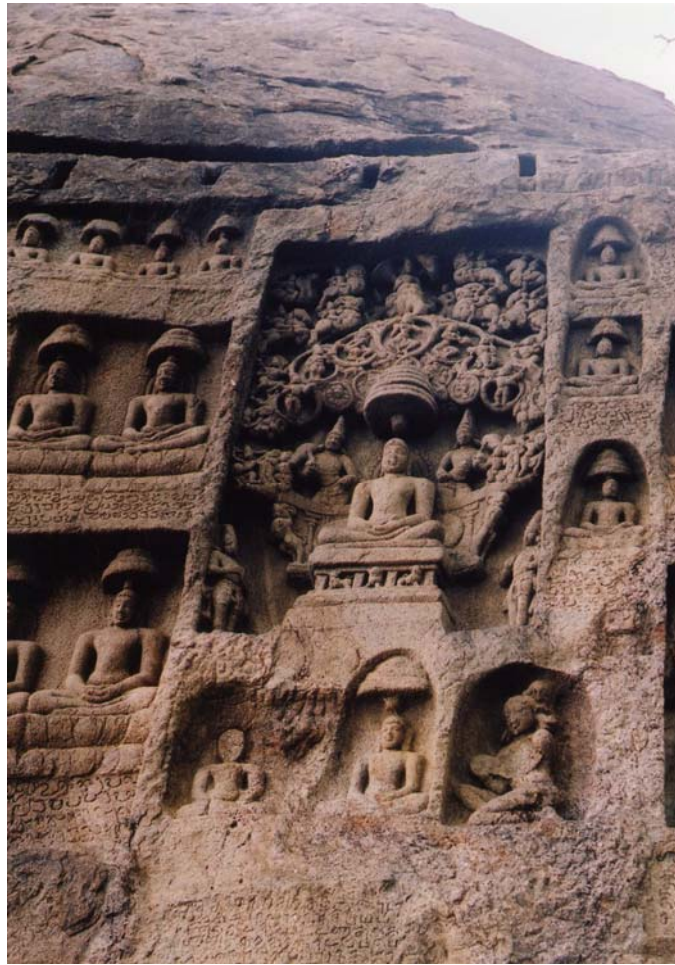
Figure 11: Detail of a Jina and laywoman from Group 5 at Kalugumalai

number of the images were commissioned by revered teachers within the monastic community along with their lay and monastic disciples. Particularly prominent are the number of female teachers (Tamil kuratti or kurattiyar ) who are mentioned specifically by name. Also noteworthy are the distances traveled to commission work at Kalugumalai. Places that are mentioned in the epigraphs include villages in modern-day Tirunelveli, Cuddalore, and Kanyakumari districts as well as the site of Jina-Kanchi (Jina-Kāñcī) in Kanchipuram district. Clearly, Kalugumalai served as an important tīrtha for local and non-local Jain communities.