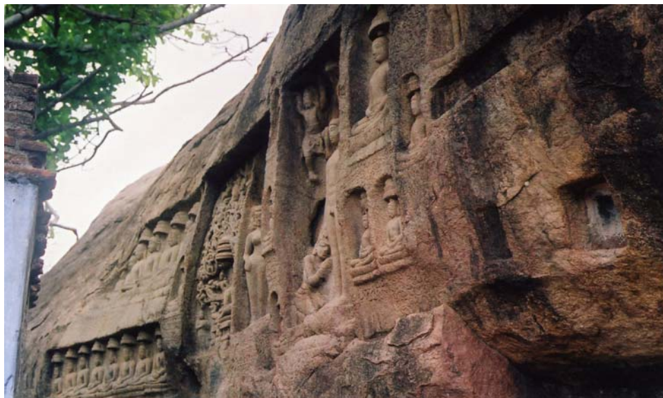
Figure 2: Detail of Group 3 at Kalugumalai

It is significant to note that the rock formations at the top of the hill remain unaltered, with the exception of their surfaces. In fact, one cannot easily separate the natural form of the boulder from its carvings. In other words, the reliefs tend to enhance the natural shapes of the rocks rather than modify them. Though images are incised in horizontal registers, their depth of carving mimics the undulations of the rock's surface (Figure 2). This differs greatly from serial images found on cave walls that are carved at roughly equal depths to heighten the illusion of a structural temple wall. Moreover, the images at Kalugumalai are presented in plain rectangular or square niches rather than the more elaborate architectural framework that is usually carved or painted around the niches of images in medieval Jain caves. The boulders and their carvings at Kalugumalai