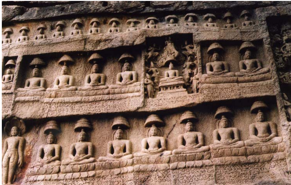
Figure 12: Detail of Jina Images from Group 5 at Kalugumalai

regard to the series of Jinas at the site, it should be stated that there are no panels at Kalugumalai that depict a unified group of twenty-four Tīrthaṅkaras. In fact, the longest continuous series (found in Group 5) contains twenty-five Jinas, each having their own donative inscription (Figure 12). The inscriptions in some ways deny a collective reading of these images as the panels for the epigraphs are carved at different surface levels to provide greater legibility. Thus, these carvings present us with a series of individual Jinas rather than a cohesive group. This is a departure from the carvings at Tirunatharkundru (Tirunatharkuṇḍru) near Gingee, for example, which clearly present the twenty-four Tīrthaṅkaras as a single entity. 12