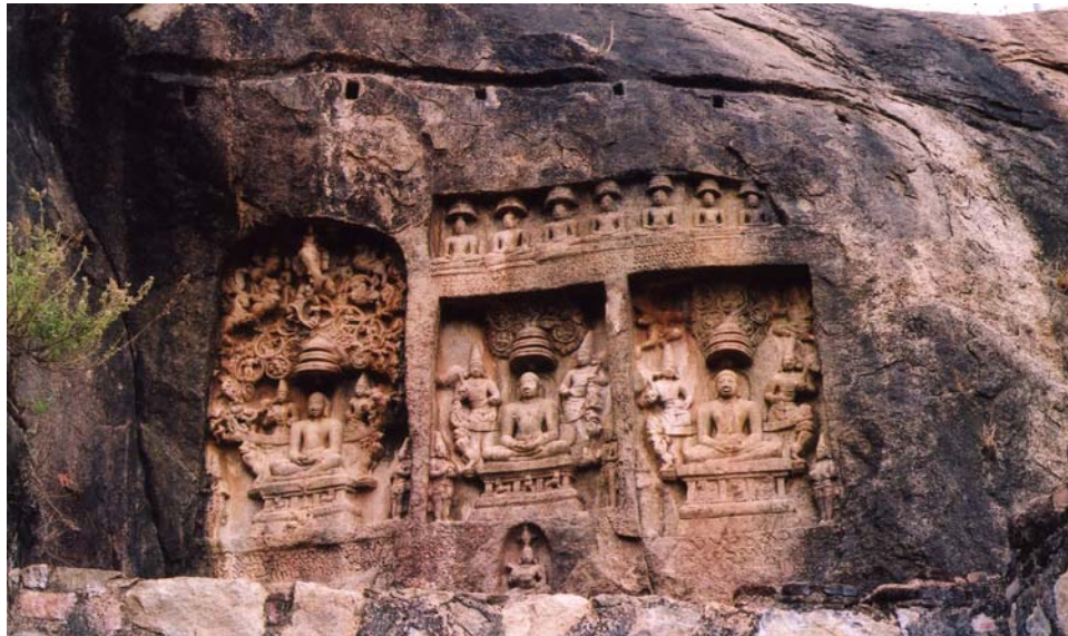
Figure 4: Group 2 at Kalugumalai

The second group of carvings is located some distance away on a rock formation that lies to the east of Group 1. These reliefs, as well as those in Group 3 discussed below, are