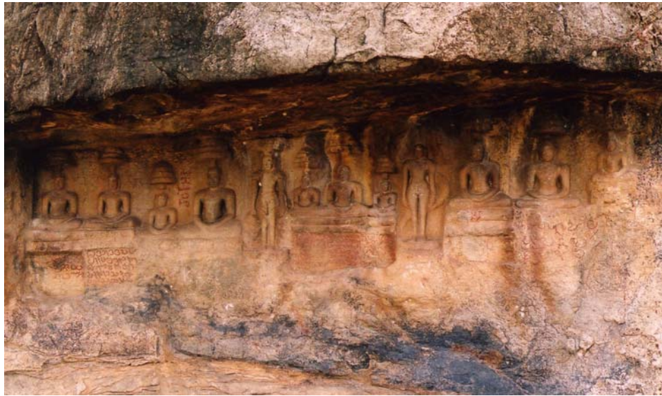
Figure 6: Group 4 at Kalugumalai