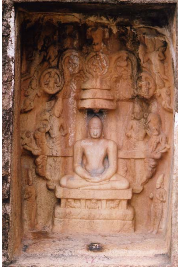
Figure 3: Group 1 at Kalugumalai