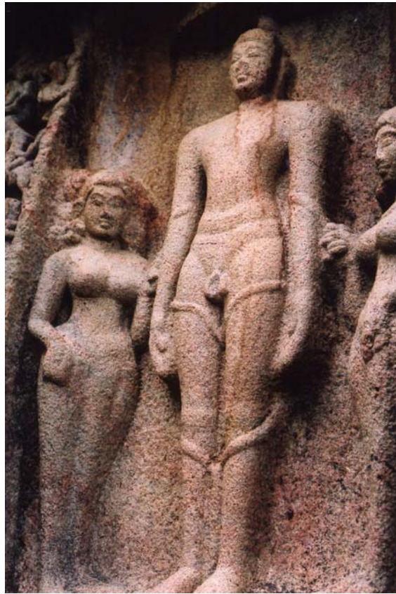
Figure 5: Gommaṭeśvara from Group 3 at Kalugumalai

of cobra hoods, Dharaṇendra is depicted in semi-human form and stands behind the Tīrthaṅkara. Dharaṇendra holds two flywhisks, thereby accentuating themes of both protection and glorification of the Jina. Dharaṇendra is the only figure that provides shelter for the Jina, as Padmāvātī is not carved with a parasol extended over the Jina's head - a narrative element which is found in most images of this period. Carved in the upper left corner of the relief is the demon Śaṃbara (also known as Meghamālin) who tried to disrupt the Jina's meditation by hurling a giant boulder at him. 5 As in other rock-cut representations of the attack on Pārśvanātha, the demon's hands are raised above his head suggesting that the upper ledge of the niche is his weapon of destruction. This element can be interpreted more literally here at Kalugumalai as it appears that the demon is about to hurl the very boulder that the relief is carved upon.