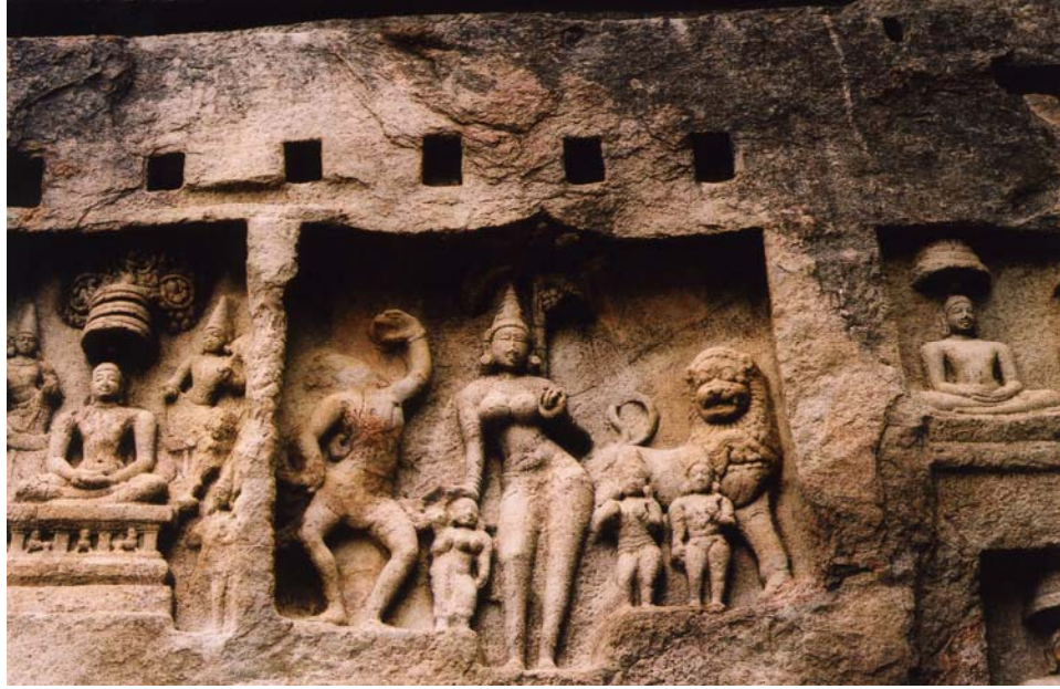
Figure 10: Ambikā from Group 5 at Kalugumalai