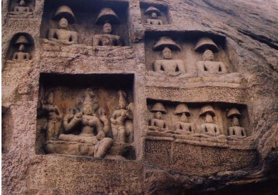
Figure 9: Padmāvātī from Group 5 at Kalugumalai

Also in contrast to the other four groups, the reliefs comprising Group 5 include two individual panels of female deities: the goddesses Padmāvātī and Ambikā. Rather than