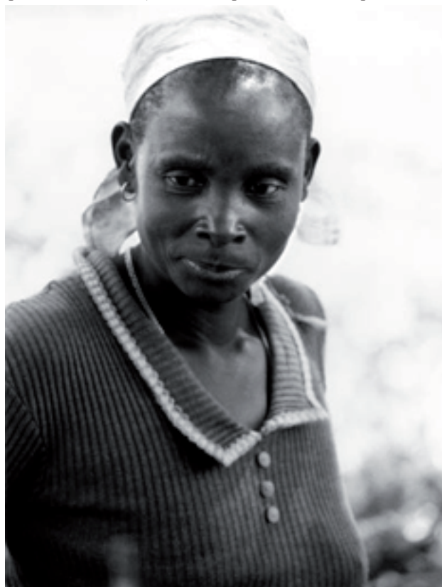
Respondent for life history

In contrast, MRLS methods, starting with a purposive sampling of people working for wages, ensured that the survey would cover a significant representation of the poorest Mozambicans working for wages in rural areas and capture the heterogeneity of their livelihoods and income levels.